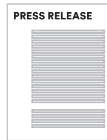
PRESS RELEASE COPY

THE FOLLOWING ITEMS WILL BE AVAILABLE FOR DOWNLOAD, ALONG WITH LOGOS AT: aabb.org/accreditedresources